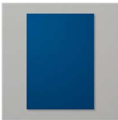
Night Of Navy A4 Cardstock - 106577