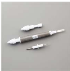
Take Your Pick - 144107