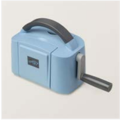
Boho Blue Limited Edition Mini Stampin' Cut & Emboss Machine - 161104