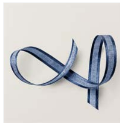
Night Of Navy 3/8" (1 Cm) Bordered Ribbon - 160581