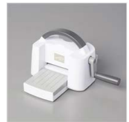
Mini Stampin' Cut & Emboss Machine - 150673