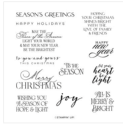
Brightest Glow Cling Stamp Set (English) - 159542