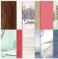
One Horse Open Sleigh 6" X 6" (15.2 X 15.2 Cm) Designer Series Paper - 162118