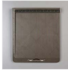
Simply Scored Scoring Tool - 122334