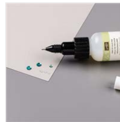
Fine-Tip Glue Pen - 138309