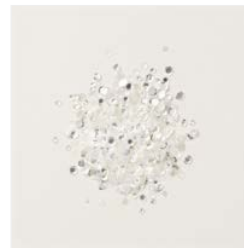
Loose Silver Sequins - 161626