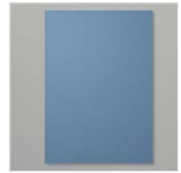
Misty Moonlight A4 Cardstock - 153086