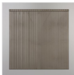
Simply Scored Metric Scoring Plate - 127531