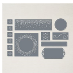
Labels Aglow Dies - 159551