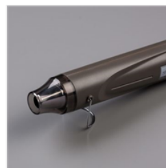
Heat Tool - Sp Plug - 129056