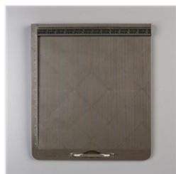
Simply Scored Scoring Tool - 122334