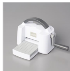
Mini Stampin' Cut & Emboss Machine - 150673