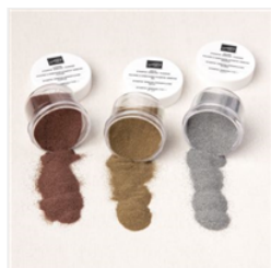
Metallics Embossing Powders - 155555