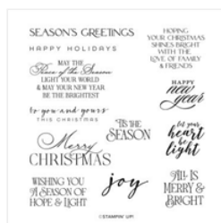
Brightest Glow Cling Stamp Set (English) - 159542