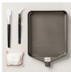
Embossing Additions Tool Kit - 159971