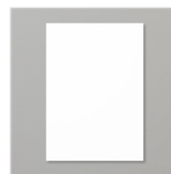
Basic White A4 Thick Cardstock - 159230