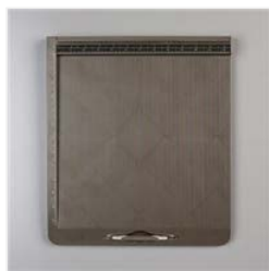
Simply Scored Scoring Tool - 122334