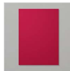
Cherry Cobbler A4 Cardstock - 121681