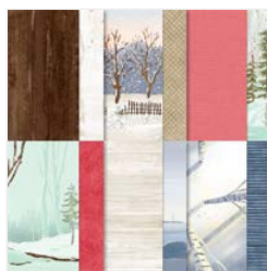
One Horse Open Sleigh 6" X 6" (15.2 X 15.2 Cm) Designer Series Paper - 162118