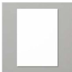
Basic White A4 Thick Cardstock - 159230