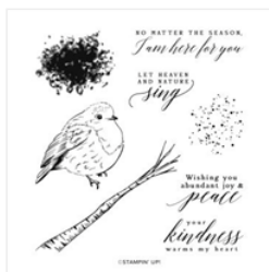
Perched In A Tree Cling Stamp Set (English) - 159791