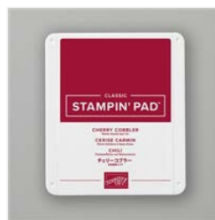
Cherry Cobbler Classic Stampin' Pad - 147083