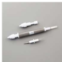
Take Your Pick - 144107