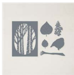
Aspen Tree Dies - 159798