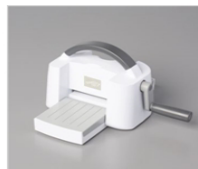
Mini Stampin' Cut & Emboss Machine