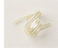
Gold & Vanilla 3/8" (1 Cm) Satin Edged Ribbon