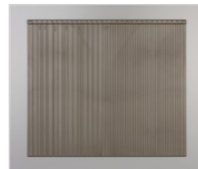
Simply Scored Metric Scoring Plate