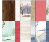
One Horse Open Sleigh 6" X 6" (15.2 X 15.2 Cm) Designer Series Paper