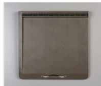
Simply Scored Scoring Tool