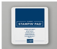
Night Of Navy Classic Stampin' Pad