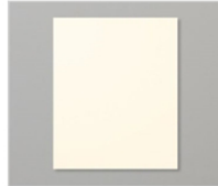
Very Vanilla A4 Cardstock